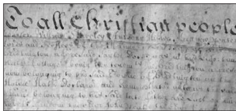
Part of the ancient document.

local graphologists and their reading of the ancient lettering states "ye well by ye Bailey Gate shall have a depth of ten ells. At ye bottom thereof shall be ane tunnel built, two ells high, one ell wide, to a distance sufficient to reach ye harbour."